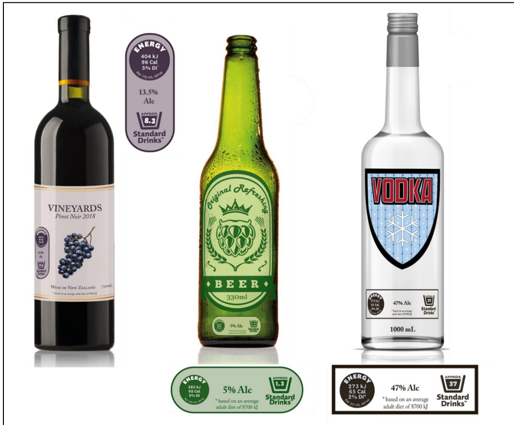
Figure 4: Label 4 (Front-of-bottle combined label)

Label 4 was a front-of-bottle label with all information (standard drinks, % alcohol content, and energy content with % DI) contained in a single label (Figure 4, Appendix 1). This label was the preferred label (of the four labels presented to the seven focus groups).