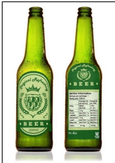
Figure 1: Label 1 (Nutrition information panel, back-of-bottle)

The NIP on the back of a beer bottle appealed only to a limited number of people (Figure 1, Appendix 1). Participants who liked the NIP stated that they liked seeing the detail about different elements in the drink and that if they wanted to see the information, it was on the back of the bottle. They also liked the familiarity of the NIP and that it was packaged in a way that