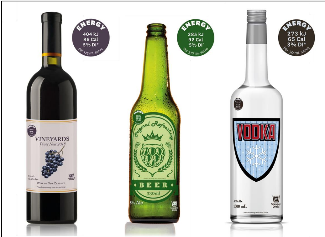
Figure 3: Label 3 (Front-of-bottle separated label, energy icon with % DI)

This label was a variant of the second label, and included % DI underneath energy content - along with the words “based on an average adult diet of 8700 kJ” (Figure 3, Appendix 1).