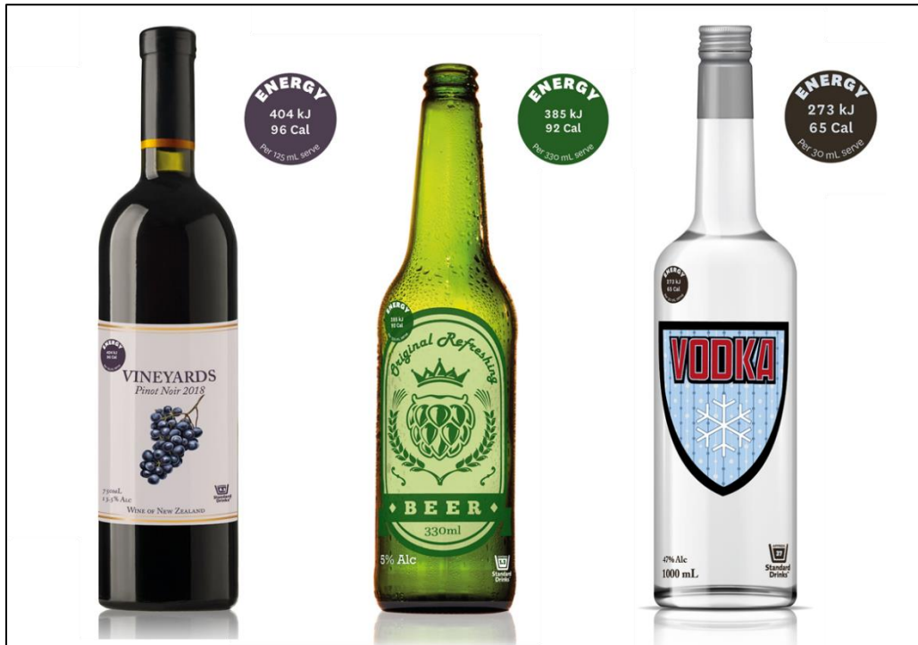
Figure 2: Label 2 (Front-of-bottle separated label, energy icon without % DI)

Label 2 was an energy label on the front of the bottle that stated the energy content per serve in kilojoules and calories (Figure 2, Appendix 1). Participants perceived this label as eye catching and simple. This label tended to appeal to participants more than the NIP (Label 1). People found this label more convenient as it took less effort to process the information and was more noticeable.